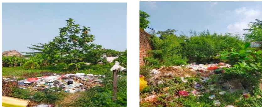
Figure 4. Environmental Conditions of Candi Village

The Regency/City Office is led by a Head of Office who is accountable to the Regent/Mayor through the Regional Secretary. They implement regional autonomy and decentralization tasks. The office can establish branches and technical implementing units in sub-districts, which are led by branch heads accountable to the Head of Office and the sub-district head. The offices are classified into 3 type, such following below: