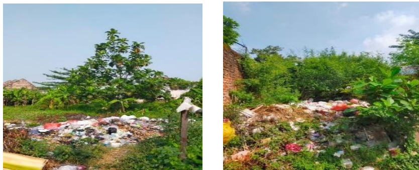
Figure 2. Environmental Conditions of Kalitengah Village