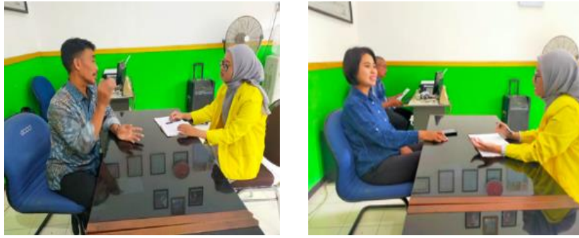
Figure 3. Interviews with Candi Village Government and Local Residents