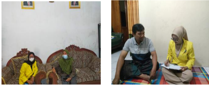
Figure 1. Interviews with Kalitengah Village Government and Local Residents